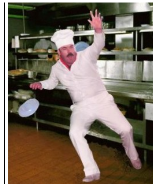
Tests for slip resistance