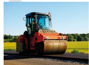
Use of Crumb rubber