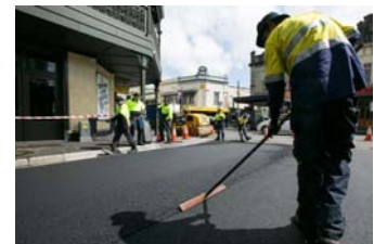
Use of Toner pave by City of Sydney