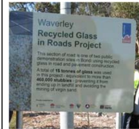
Use of crushed glass for pavements by Waverley Council