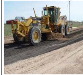
In situ Stabilisation

Examples of the use of recycled materials for pavement construction and rehabilitation