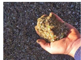
Crushed glass sand produced by Lismore City Council