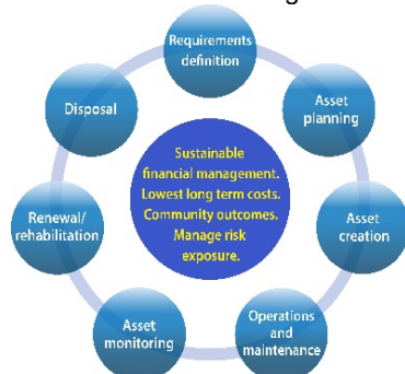
Asset life cycle activities

The life cycle activity of an asset is defined as the activity commencing with the identification of the need and terminating with the decommissioning of an asset.