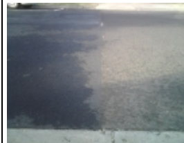
Treated and untreated surface to reduce water infiltration