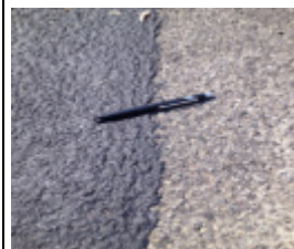
Left side shows condition of 20 yr asphalt surfacing due to binder oxidation