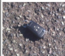
Condition at 18yrs - no treatment