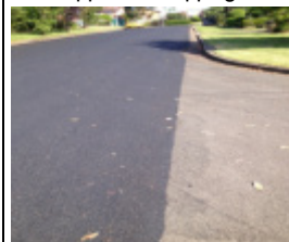
PME applied to local road to preserve ravelled asphalt surface