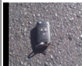
Same age asphalt surface following 3 applications of Enrichment treatment